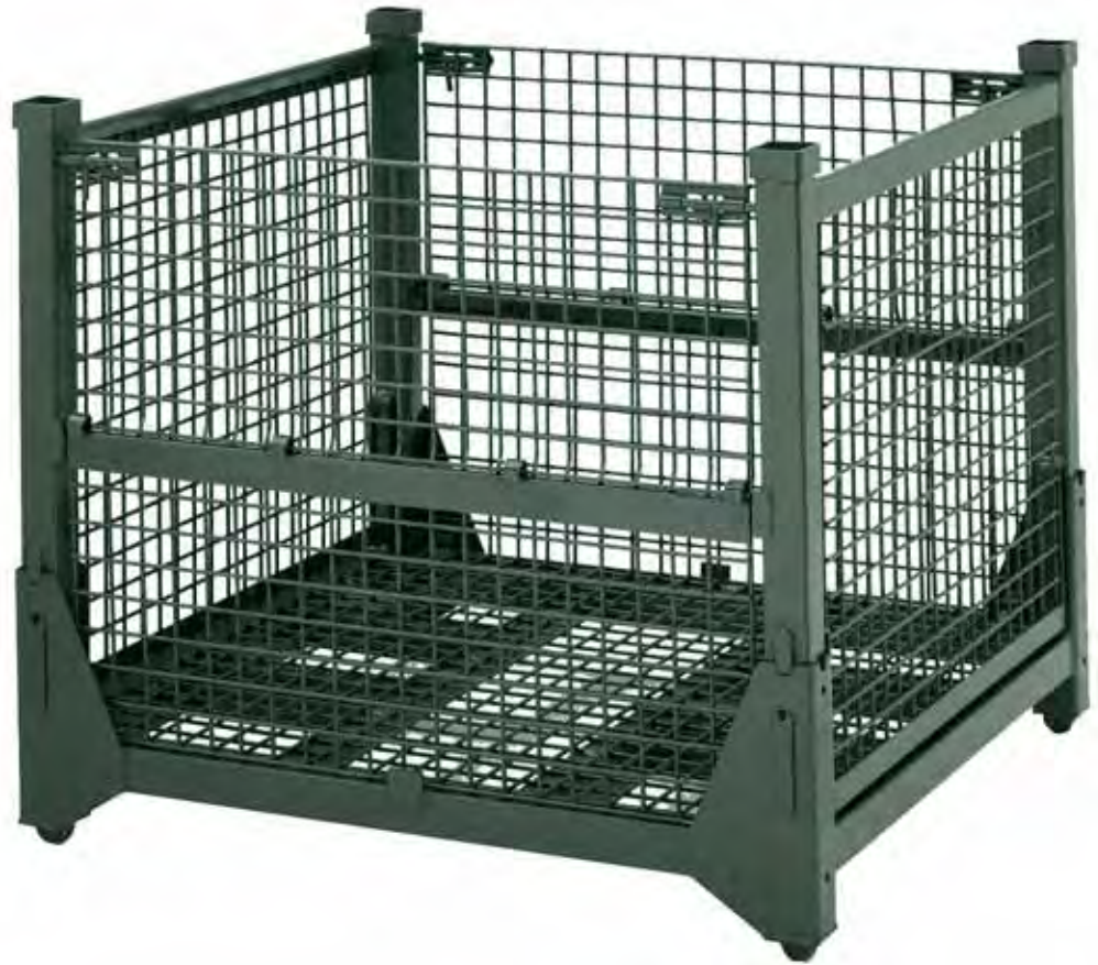
Available with corrugated steel or wire mesh sides.

Since 1970, Steel King industrial containers have set the standard for design and durability. Many standard and custom styles available, all with unique advantages that make all Steel King containers more convenient to use and longer lasting.