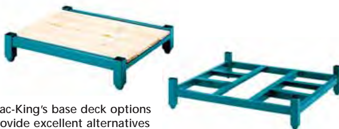
Stac-King's base deck options provide excellent alternatives for various industry applications.