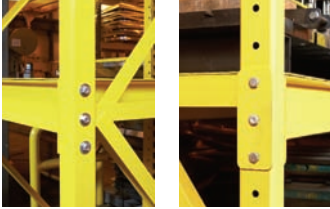
Position drilled 3" adjustability

Steel King Die Storage Racks are designed to meet the most demanding requirements. Standard die storage racks feature: