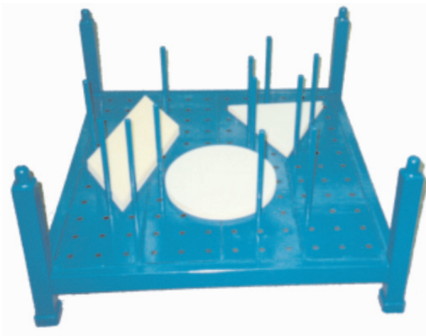
Details of pins and parts

Steel King specializes in the the custom design of shipping racks to better meet our customers' requirements. The Stac-King Pin Rack is no exception! An adaptation of our popular Stac-King portable rack, the Pin Rack uses a double-level sheet metal deck perforated to accept drop-in pins, allowing custom configurations for a wide variety of odd-shaped parts. The Pin Rack is ideal for handling steel stampings, blanks or other flat goods.