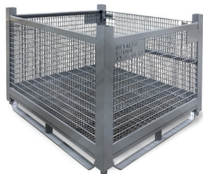
Heavy Duty Rigid Wire Container

Available options include: Drop gates; Skid Bars, Fork Stirrups; Crane eyes/hooks; Roll-over Runners, Casters and Galvanizing