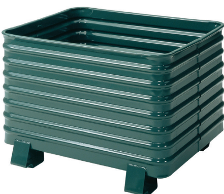
Heavy Duty Corrugated Container