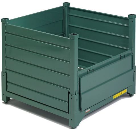
Hold 'n Fold