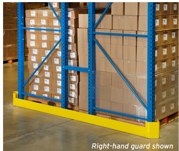
Right-hand guard shown