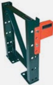
Structural Pallet Rack