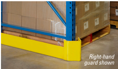
Right-hand guard shown